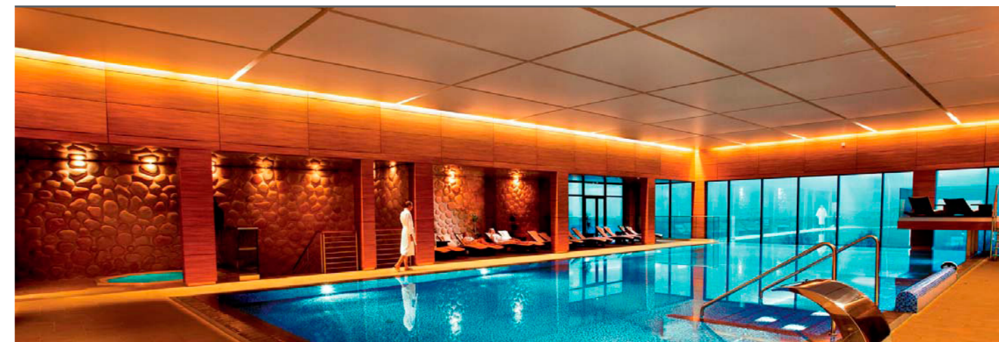
A glazed wall at a swimming pool with an overflow crest guarantees an unforgettable view of the Kielce townscape. The other walls have been clad with hundreds of square meters of panels.