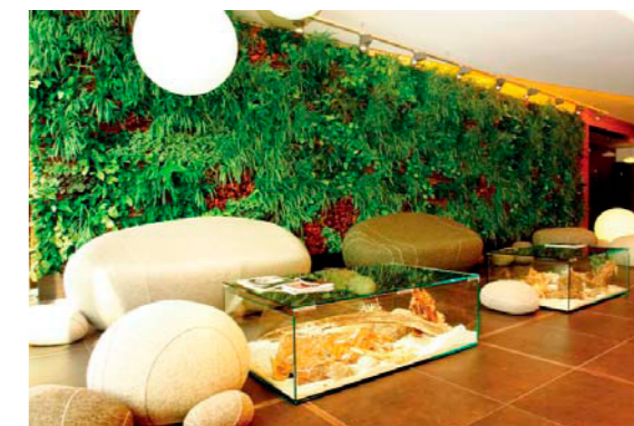
Reception area – living plant walls framed with panels.